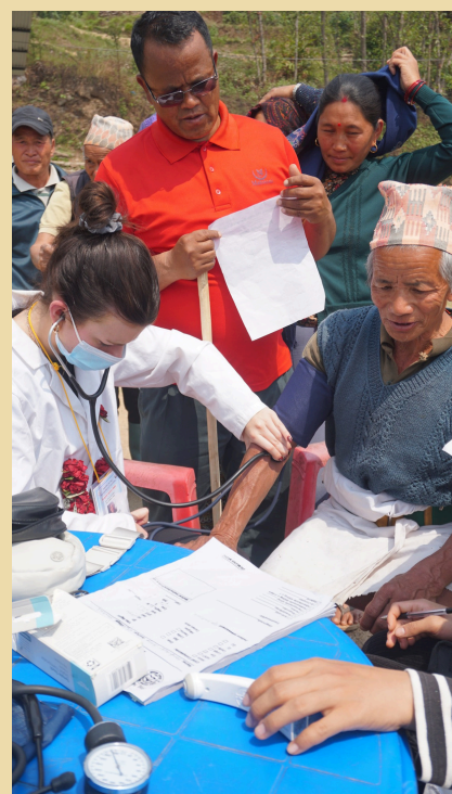
Our progress ....